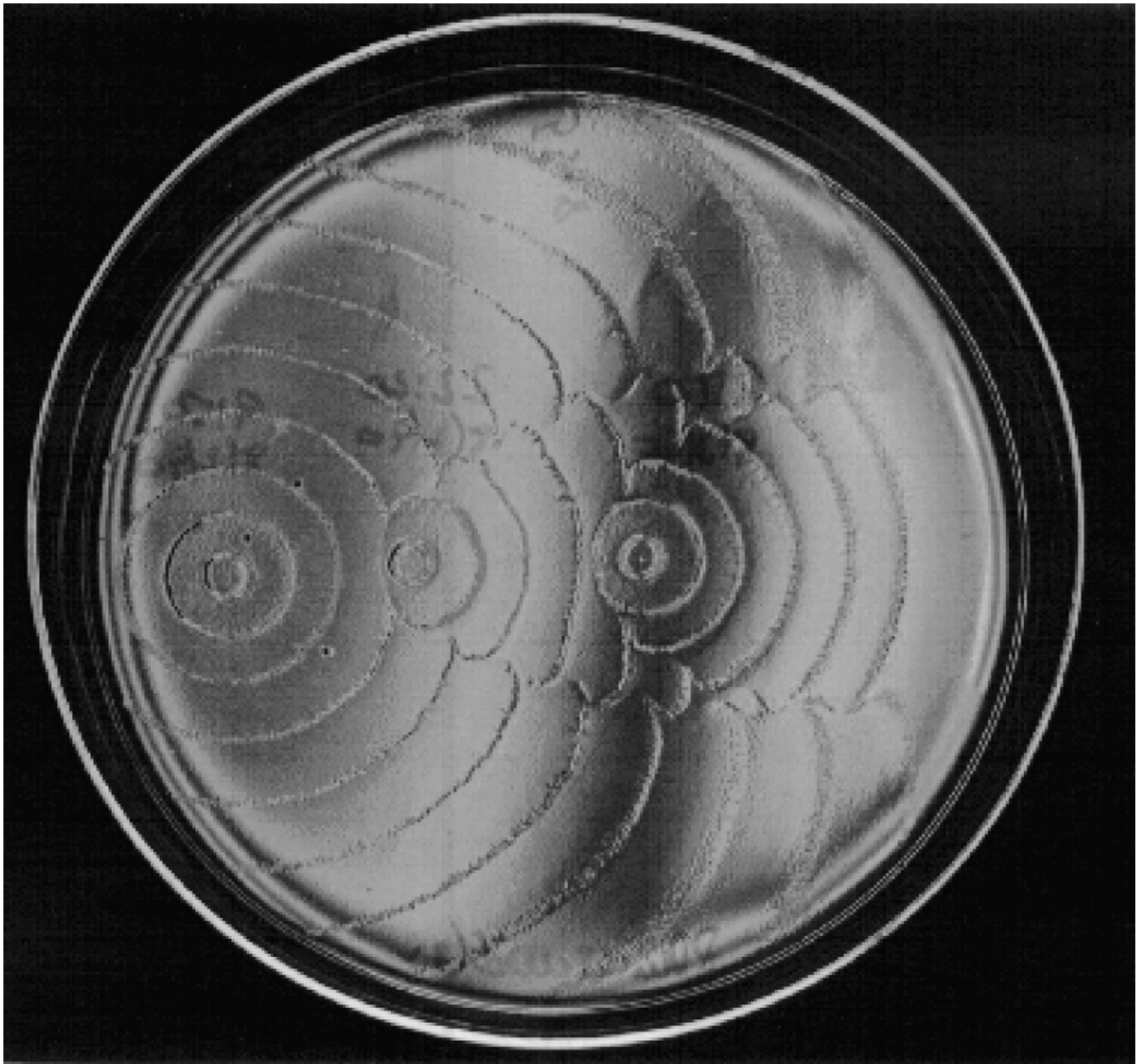
Fig. 2. Intersecting swarm colonies of Proteus mirabilis . The three spots show where the bacteria were inoculated at the start of growth (a different time for each spot). The terraces show the results of periodic spreading over the medium. The fact that the terraces do not merge when they touch indicates that periodicity results from processes internal to each colony.

adaptive however, because it gives the bacteria access to additional nutrients. In other words, seeing pattern and organization in bacterial colonies tells us that bacteria engage in regulated, coordinated behaviors, even when the biological utility of group activity may be something quite different from colony morphogenesis.