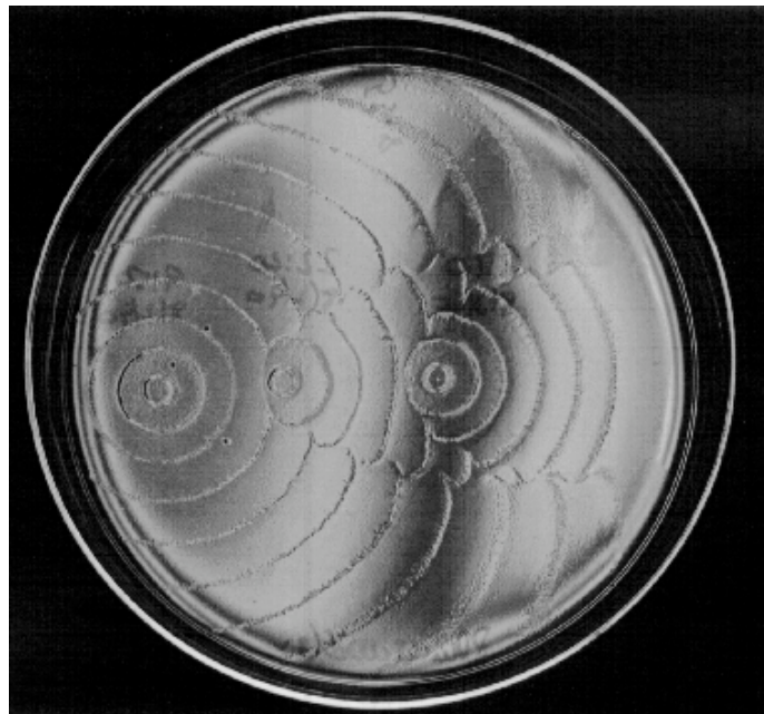
Figure 2. Intersecting swarm colonies of Proteus mirabilis . The three spots show where the bacteria were inoculated at the start of growth (a different time for each spot). The terraces show the results of periodic spreading over the medium. The fact that the terraces do not merge when they touch indicates that periodicity results from processes internal to each colony.

A related species of enteric bacteria, Proteus mirabilis , attracted my attention because it is famous for collective movement over agar surfaces (“swarming”). Studies with Proteus indicated that overall colony patterns (Figure 2) reflect the operation of highly regular systems for cell differentiation and motility (Rauprich et al., 1996; Esipov and Shapiro, 1998). It is important to note that the strikingly symmetrical colony structure apparently does not have any intrinsic functionality. But swarming motility is adaptive because it gives the bacteria access to additional nutrients. In other words, seeing pattern and organization in bacterial colonies tells us that bacteria engage in regulated, coordinated behaviors,