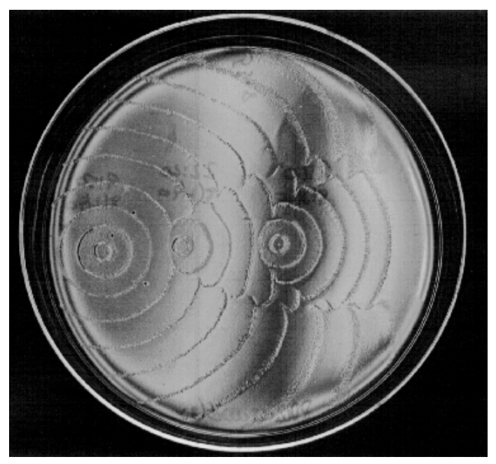
Figure 2. Intersecting swarm colonies of Proteus mirabilis . The three spots show where the bacteria were inoculated at the start of growth (a different time for each spot). The terraces show the results of periodic spreading over the medium. The fact that the terraces do not merge when they touch indicates that periodicity results from processes internal to each colony.